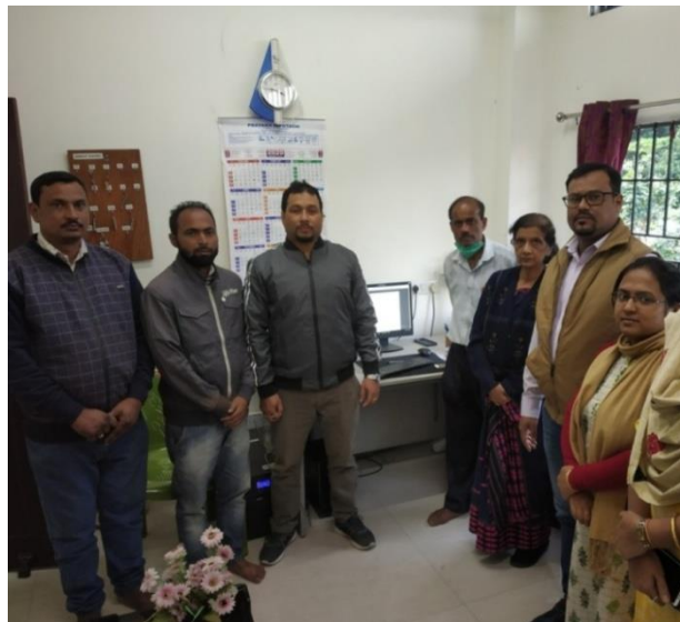
Picture 5 :A few members during the launching of the journal IJEAR Vol.7 issue 1, by maintaining the COVID-19 protocol.

(iv) Electromagnetic approaches on Earthquakeinduced precursive parameters: A review related to massive Tohokoevent.