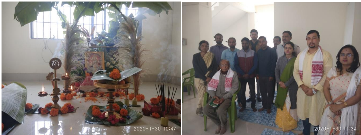
Pictur 6 .Saraswti the Godess of learning : the alter and the devotees at the ESES assmbly.